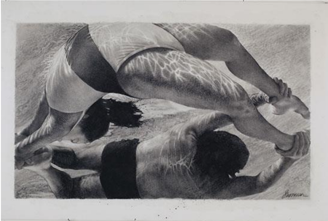
"Bridge" by Lorraine Shemesh, 2011. Graphite wash on mylar, 22 x 37 inches.

That web of light, like a loose craquelure across the curvature of their limbs, is one of the most active chromatic passages in the painting, with a flickering spectrum of golds and tangerine strokes infiltrating the blue of the pool and sky. Discretely hung in a different part of the gallery, a second drawing, the most "abstract" moment in the show, is a loose pencil version of the ghostly figures that just hints at the final work.