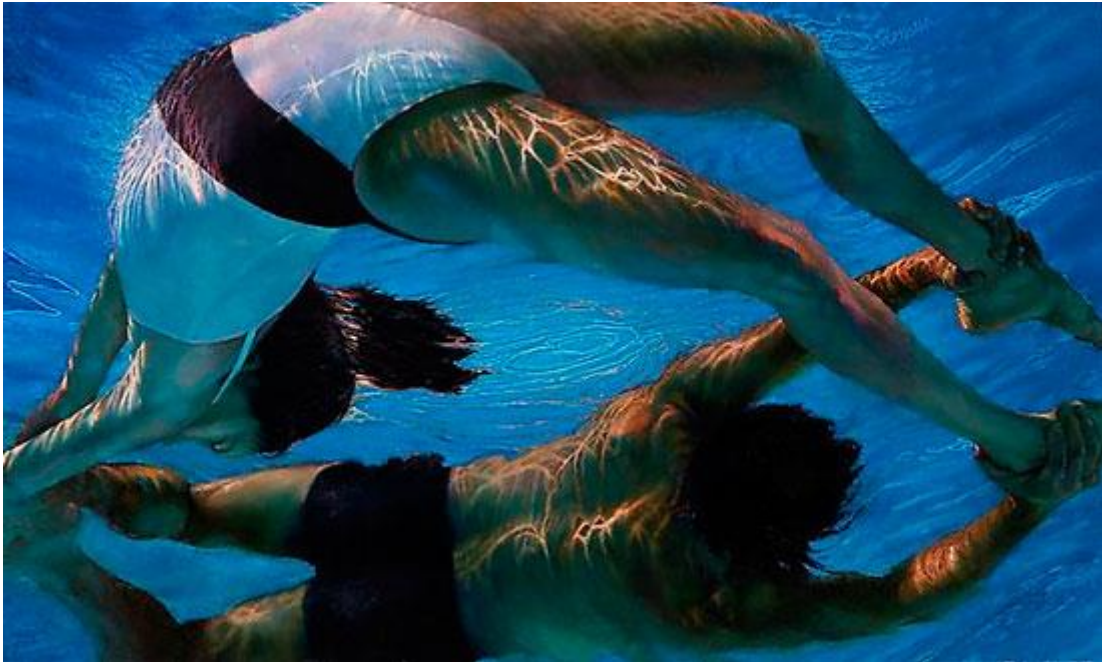
"Bridge" by Lorraine Shemesh, 2011. Oil on canvas, 47 1/2 x 79 inches.

It is enough of a challenge for even the most adept and dedicated artist at life drawing sessions to hold together the proportions and shadows in a double figure pose such as Bridge , the most compelling composition in the show. Bridge gains impact and effectiveness from the absence of all the restless deformations of disturbed water, rendering it the most secure composition in the exhibition.