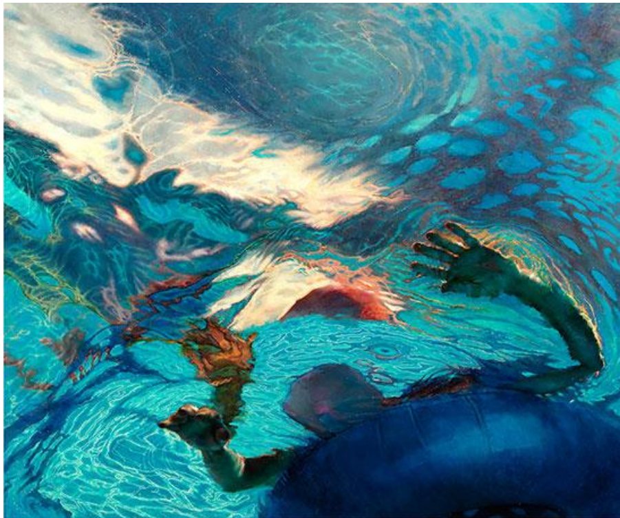
"Surrender" by Lorraine Shemesh, 2015. Oil on canvas, 58 x 70 inches.

Summer looks irresistible in the vertiginous Surrender , one of seven large oil on canvas paintings that display this accomplished figurative artist at her most virtuosic, stirring a hyperactive maze of light effects in views of a pair of outstretched hands lazily drifting outside a big indigo inner tube, as seen from the bottom of the deep end.